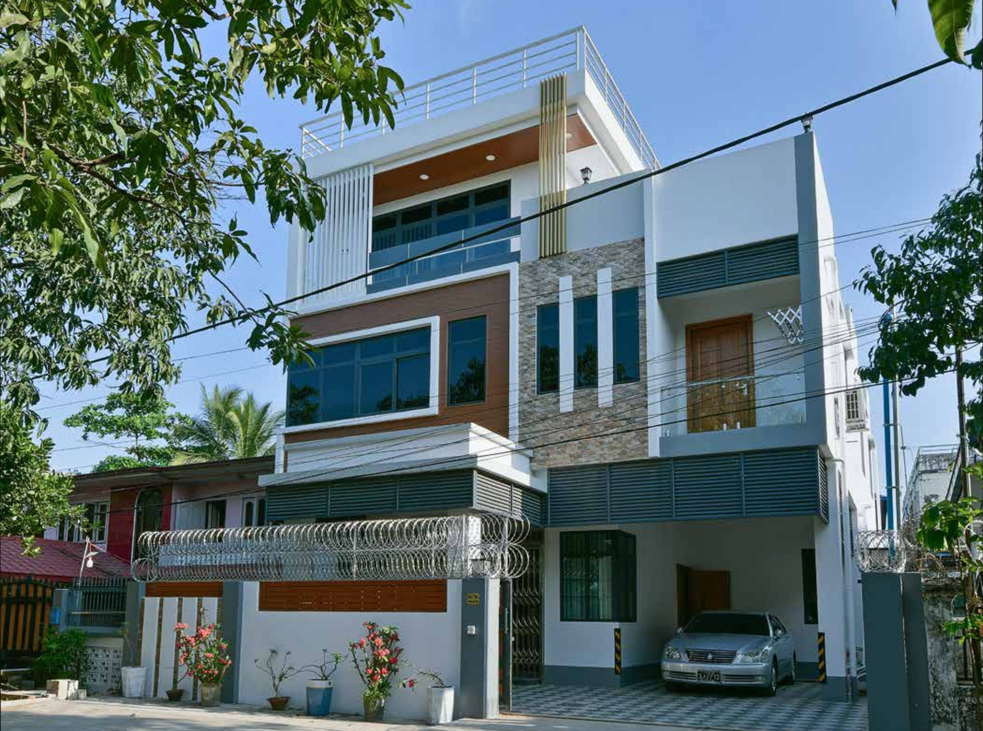
NORTH DAGON - YAMANAY STREET