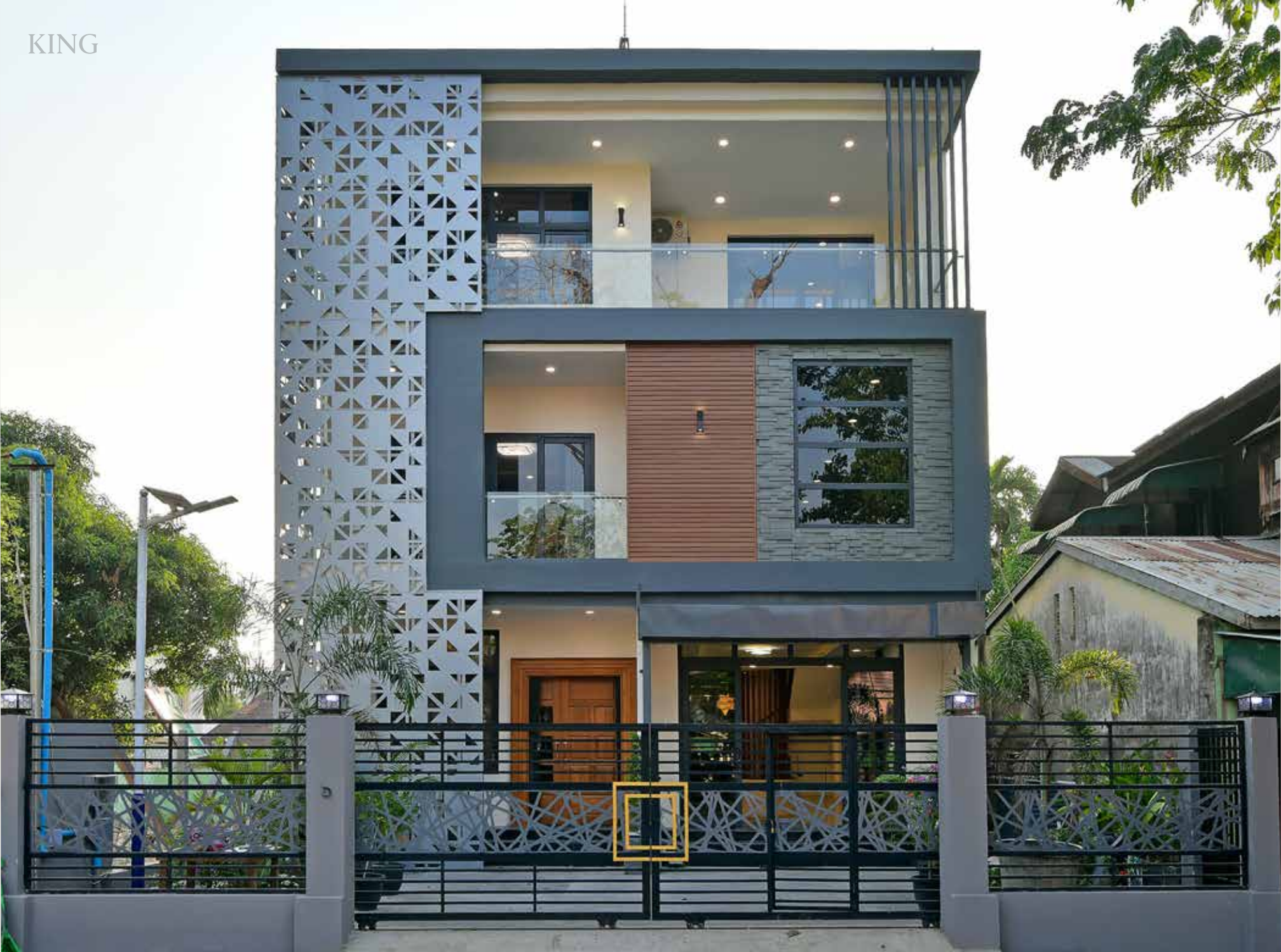
THAN LYIN PROJECT