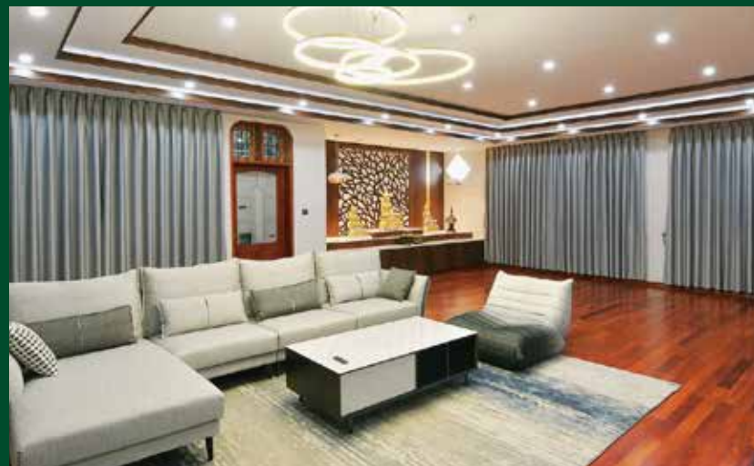
MANDALAY 107 RENOVATION

King Construction ကလည်း ဒီထက်မက အောင်မြင်ပြီး လျှောက်လှမ်းနိုင်ပါစေ။ အစစ အရာရာ စေတနာရှိရှိ ပြုပြင်ပေးခဲ့တာလည်း ကျနော်တို့ဘက်ကနေ အစ်ကိုတို့အဖွဲ့ အားလုံး ကို ဆုတောင်းပေးပါတယ်။