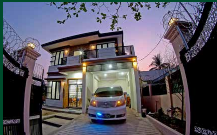
MOE MA KHA ST.

ကိုယ်တွေ လိုချင်တာတွေအကုန်လုံး မရ ရအောင် အသေးစိတ်ကအစ ကြိုးစားအားထုတ်ပေးခဲ့ တာတွေအတွက် ကျေးဇူးပါ။ ဒီအိမ်လေးထဲ နေထိုင်နေရတဲ့ အချိန်တိုင်း စက္ကန့်တိုင်းလည်း ကျေနပ်ပျော်ရွှင်ရပါတယ်။