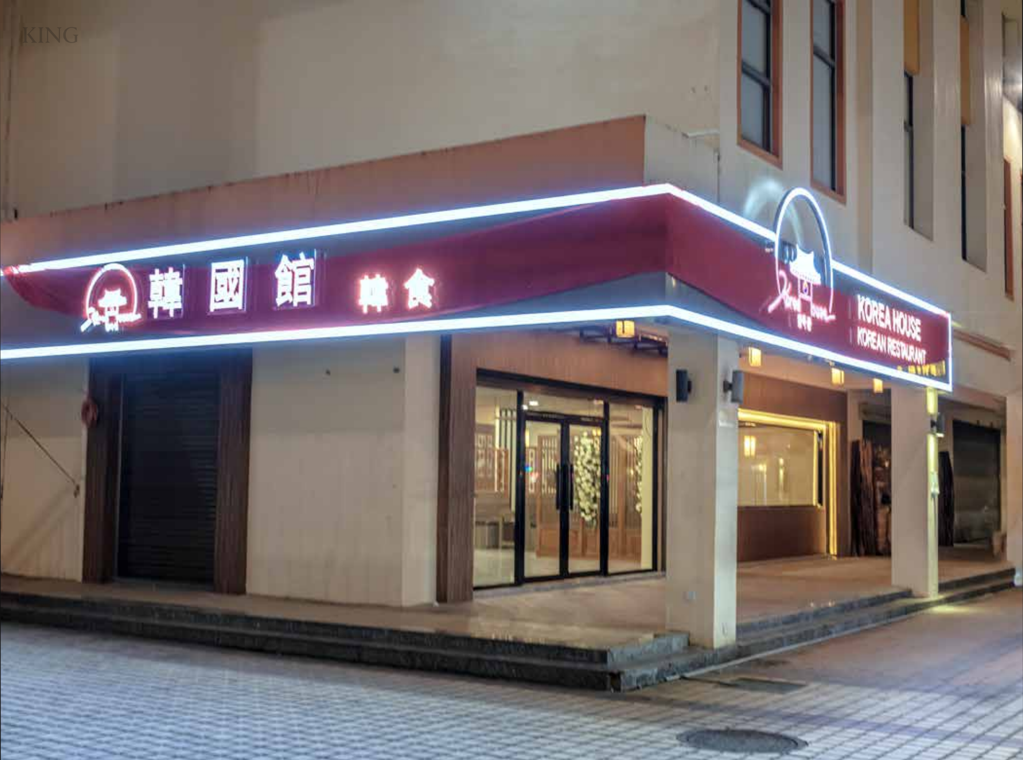
KOREA HOUSE @ MUSE